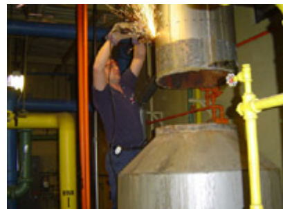
STEP 2: Cutting Out of Section of Venting to Accommodate Regulator