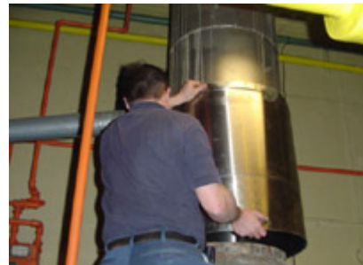
STEP 4: Installation and Adjustment of the Regulator in Boiler Venting