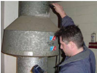
STEP 1: Pre Installation Flue Gas Analysis

Here are some pictures that show various stages of a typical atmospheric installation: