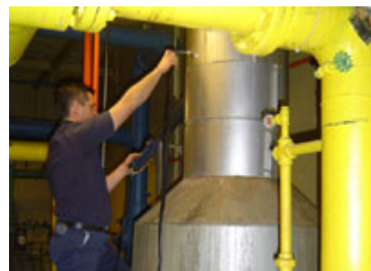
STEP 6: Post Installation