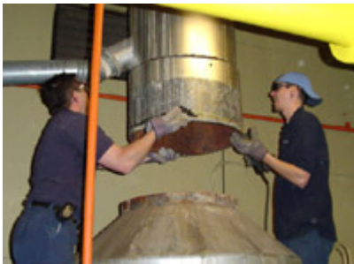
STEP 3: Final Removal of Old Venting Section