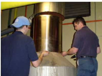
STEP 5: Securing unit